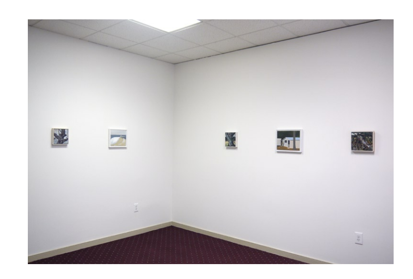
Jack Banks Fallen Cedar Oil on panel, 8.75 x 8.5", 2015