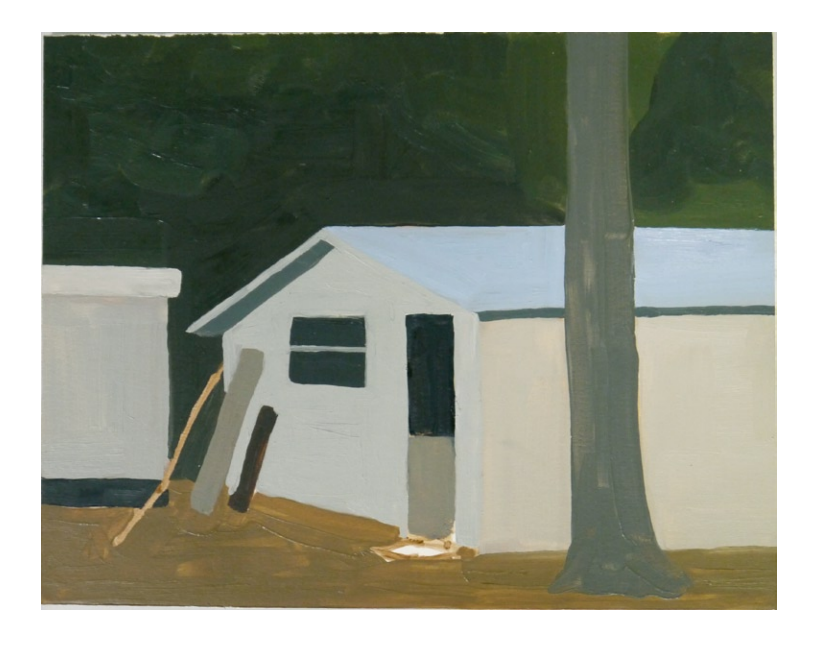
Jack Banks Locklie's Locust Acrylic on panel, 7.25 x 8", 2016