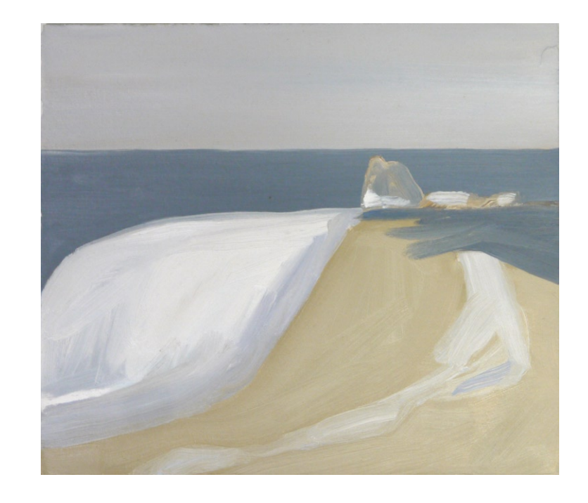
Jack Banks Boatyard Maple I Acrylic on panel, 7 x 7", 2015