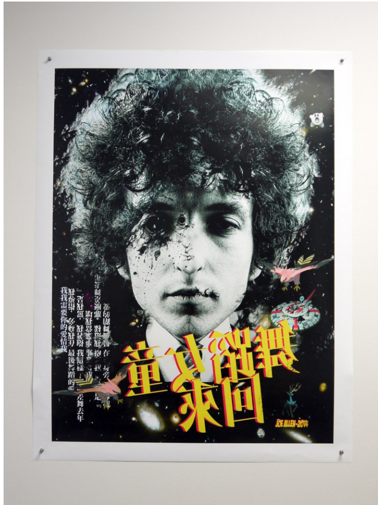
Electric Bob Ink jet print, 35 x 44", 2015