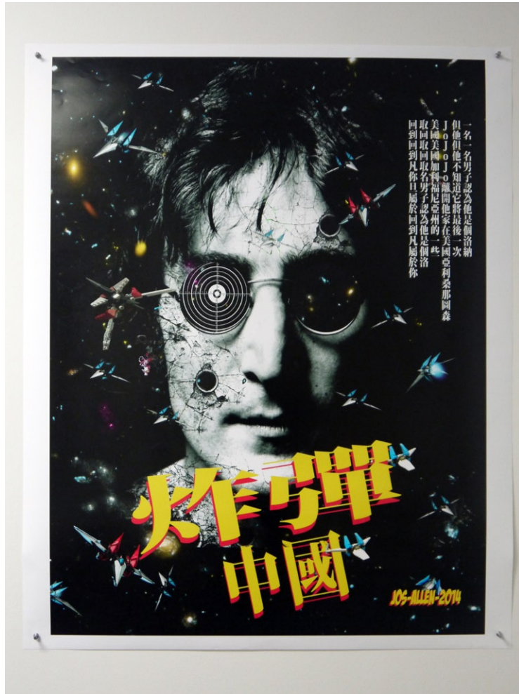
Twilight Time Ink jet print, 34 x 44", 2014