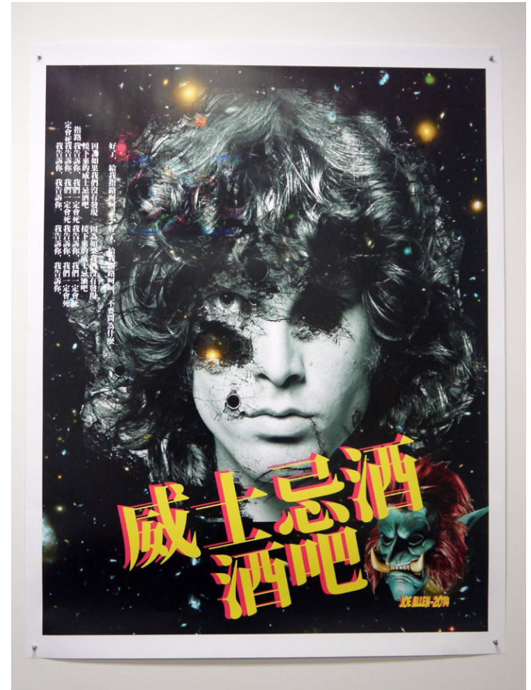
Rescue Me Ink jet print, 43 x 55", 2014