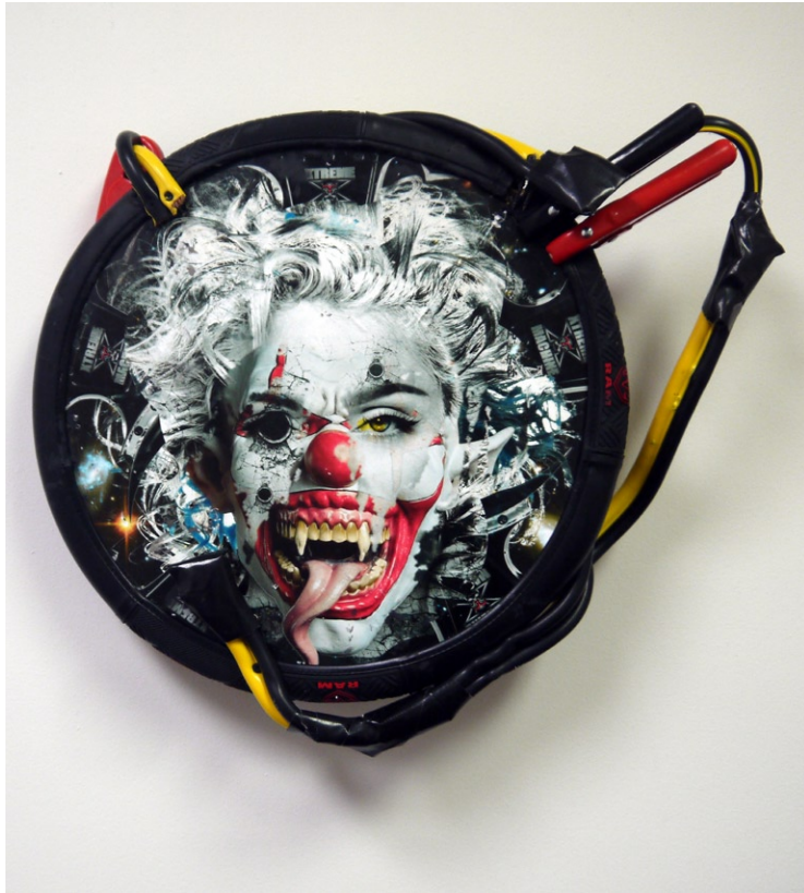
Christine Ink jet print, wood, and battery cables, 23 x 20 x 5", 2017