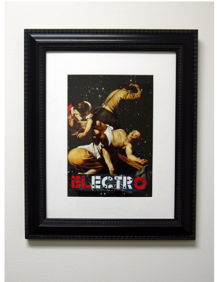
(Is Anybody Going To) San Antone Ink jet print, framed, 17.5 x 21", 2014