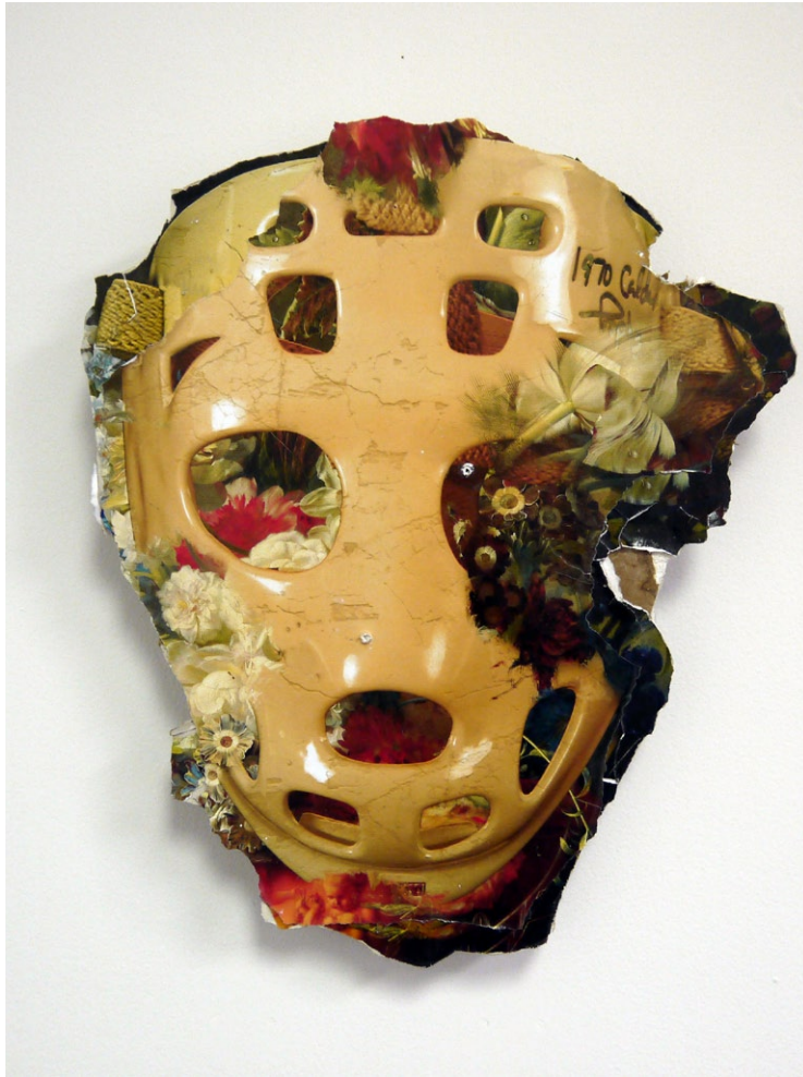
In the Still of the Night Ink jet print, sheetrock, and wood, 14.4 x 17.5 x 2.5", 2015