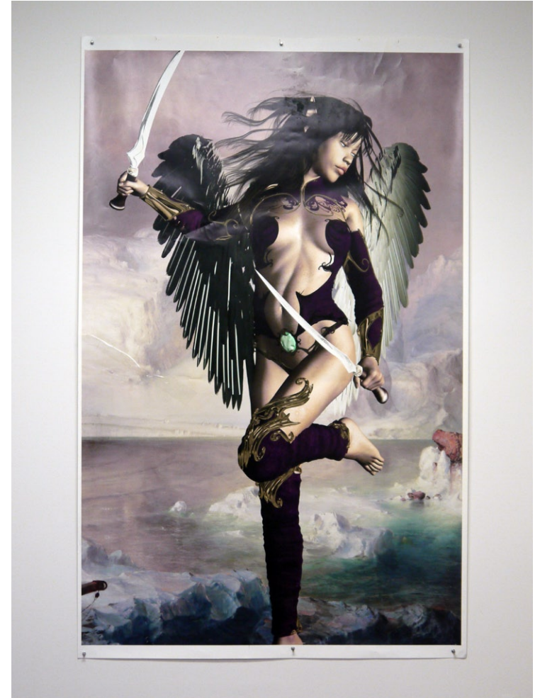
Cold as Ice Ink jet print, 44 x 70", 2010